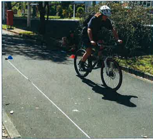
We have a talented bunch!