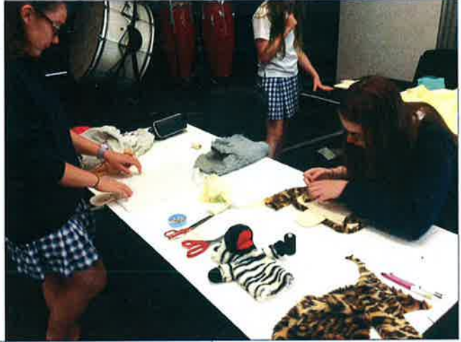
Puppet Schmuppet' various puppets that the students have made this semester.