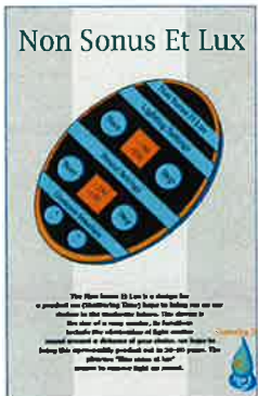
Some of the art work that has been created in various Visual Communications & Design classes.